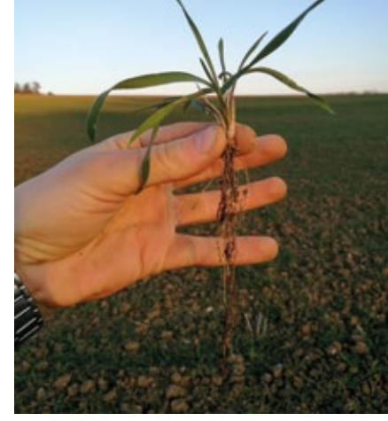
The crop is usually firmly rooted